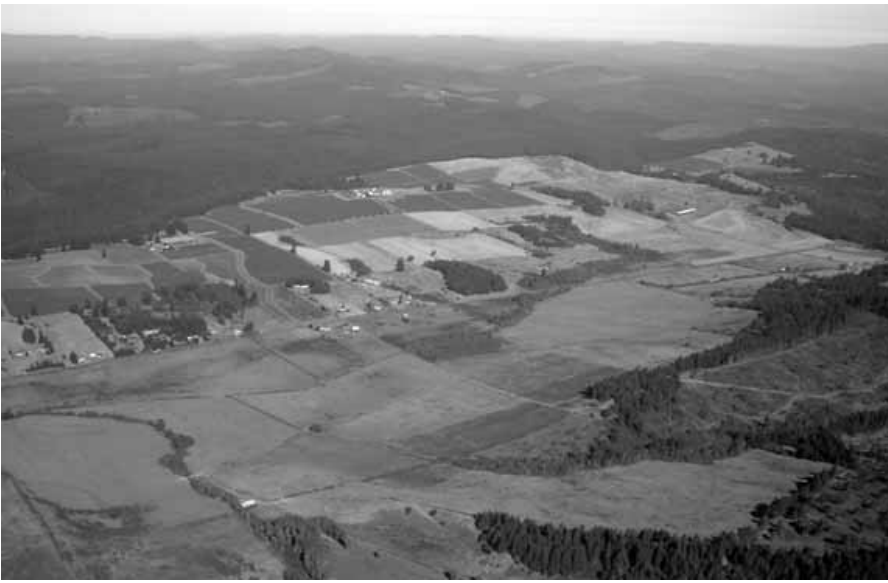
Todd's photo of the Lorane Valley